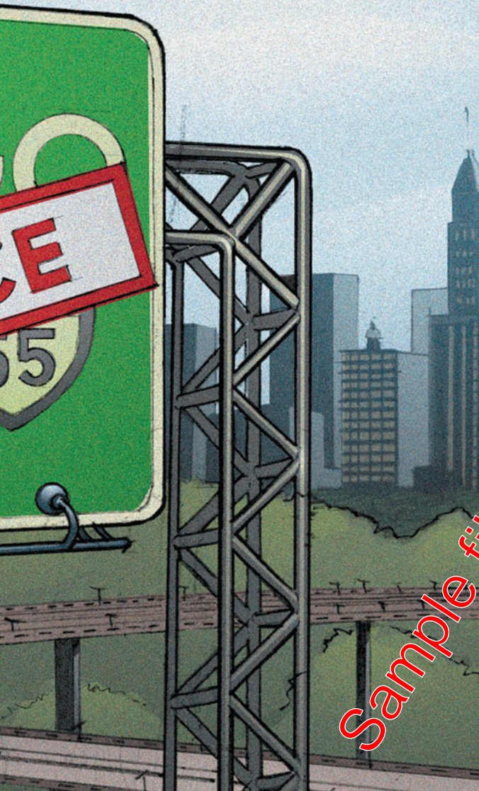
Chicago: No one gets out, or in.