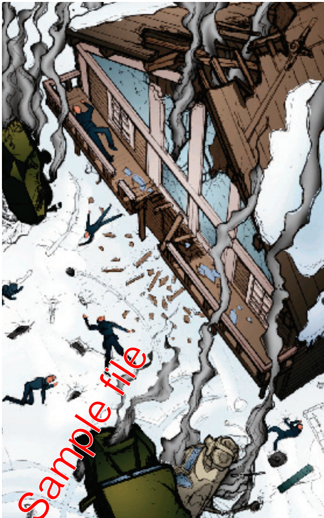
The aftermath of the Colorado siege.