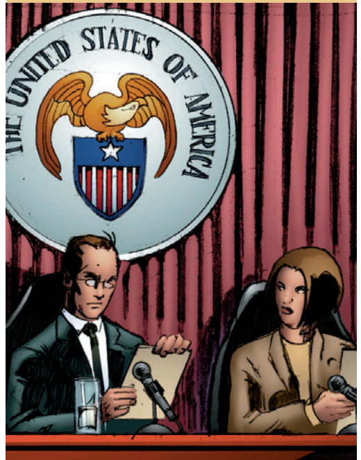
The Senate Select Committee on Specials invokes the Stanwick powers Act.

What is less certain is the sequence of events that took place in the days and weeks after subpoenas and warrants were issued by the Senate. ●