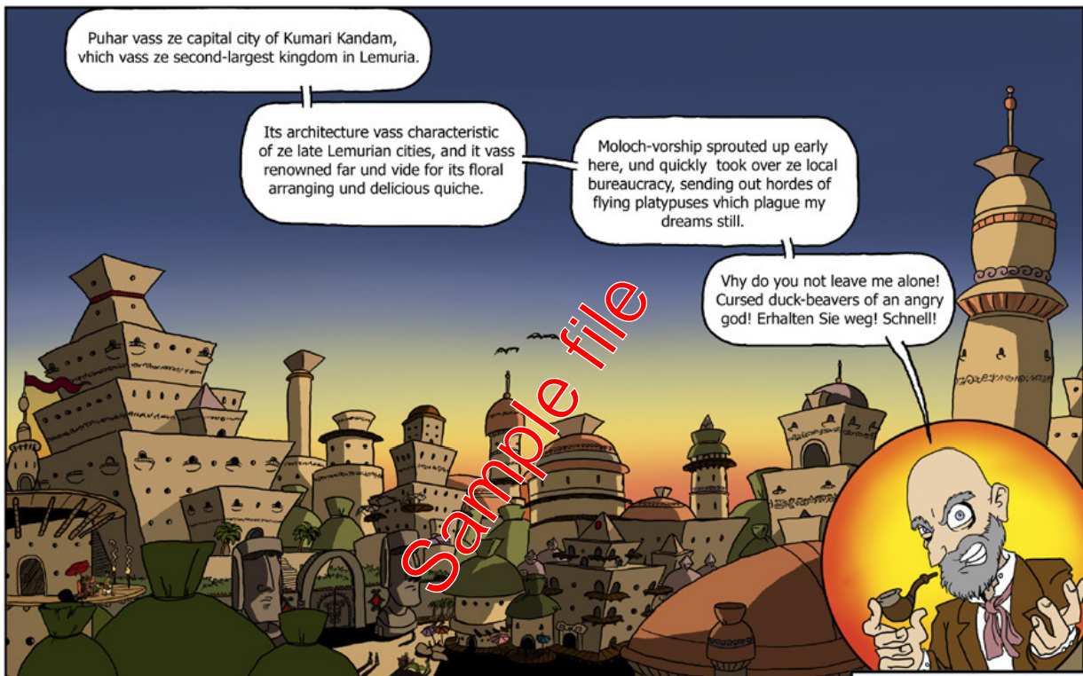
Rudolf Schnitzenschnaller —19th century crackpot