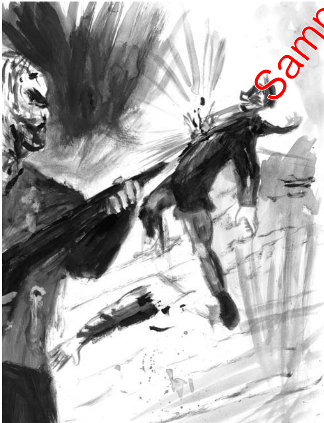
The Battle of Black Ridge

Battleground is an adventure setting for use in the Gunslingers and Gamblers role-playing game. This location is haunted by the undead Civil War soldiers who rise from their graves once a year in order to fight once more. Every year on Nov 3, the Battle of Black Ridge is fought once again by the soldiers who lost their lives there. Locked in a cycle of perpetual hate, many of these tortured souls are convinced that they are still alive and fighting the battle for the first time. Others have decided that the only way to gain eternal peace is by completing their final task in life, winning the battle.